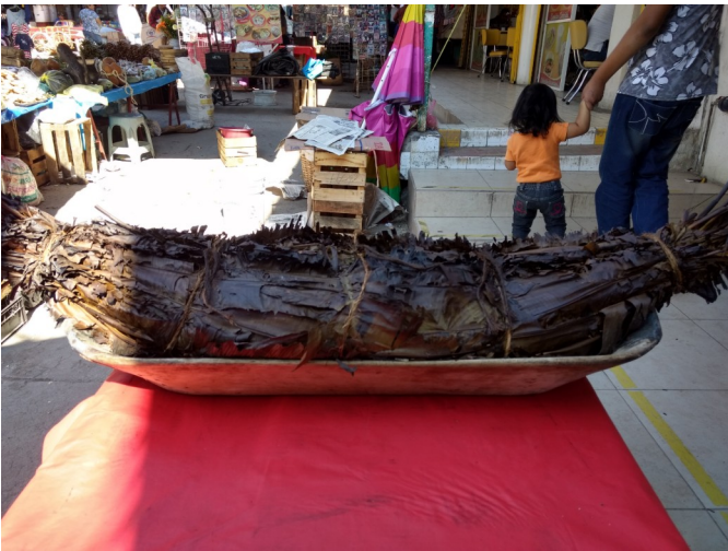
Cooking School Fair: